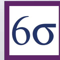
Six Sigma Methodology Management System Using Effective Statistical Tools to Ensure Operational Excellence