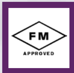
FM Approval Approval for Meeting Product Quality, Technical Integrity, and Performance Standards